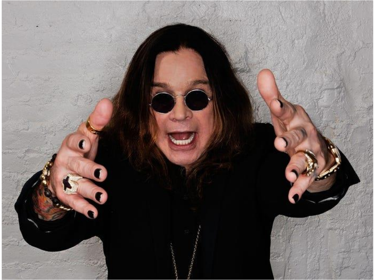
Ozzy Osbourne.

Through DNA testing , the British rocker found out that he is related to Russian Tsar Nicholas II and English King George I.