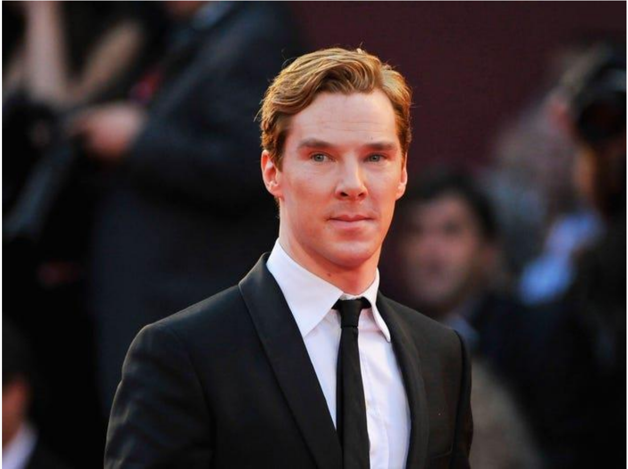
Benedict Cumberbatch.

The "Sherlock" actor played the 15th-century king in a BBC adaptation of Shakespeare's "War of the Roses" plays called "The Hollow Crown."