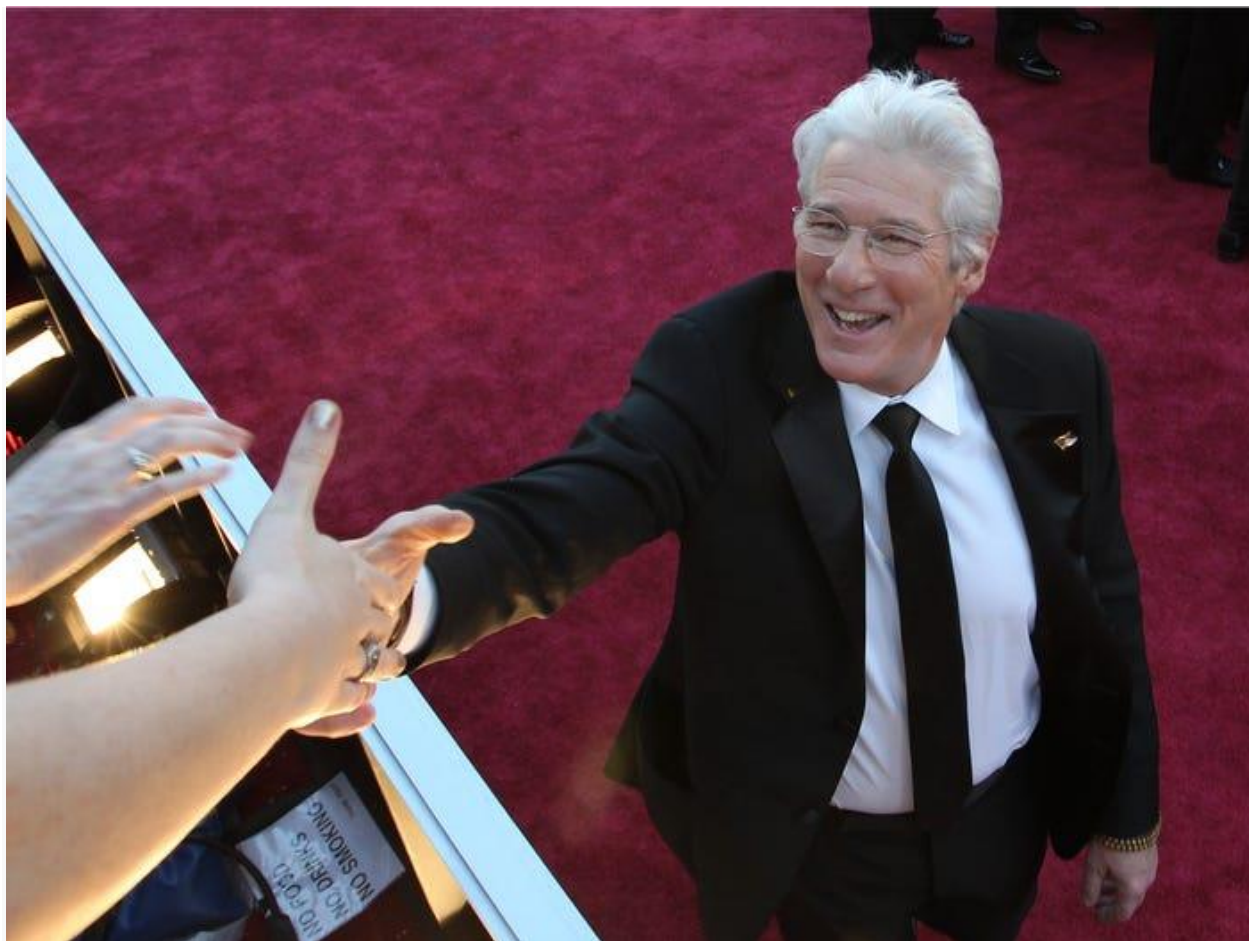
Richard Gere.