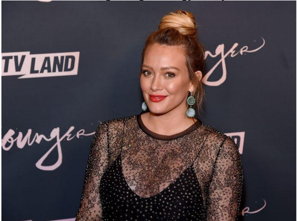
Hilary Duff.

Actress Hilary Duff is an 18th cousin of Queen Elizabeth, according to a genealogy study.