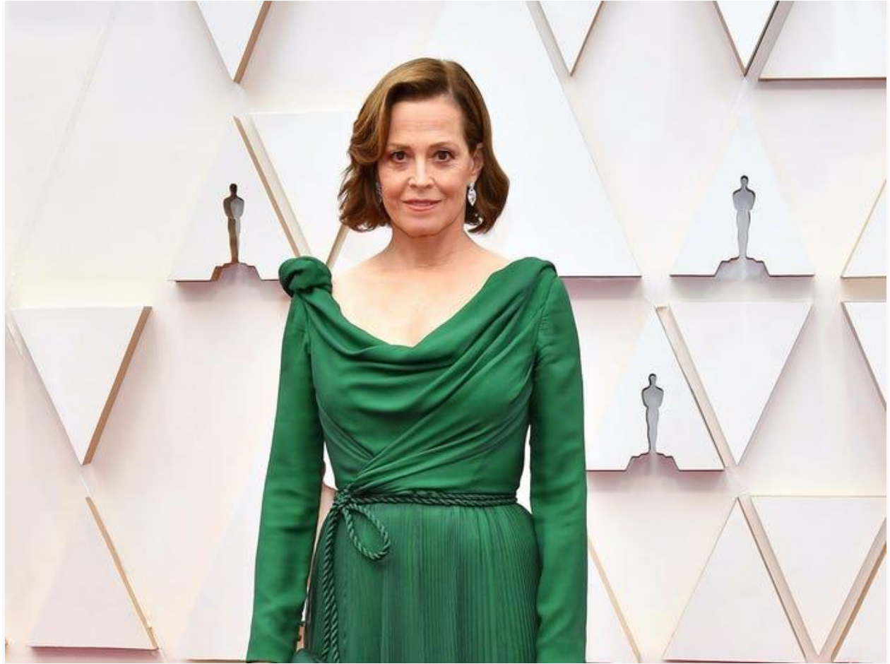
Sigourney Weaver attends the 2020 Oscars.

Weaver's connection to royalty is through King Henry I.