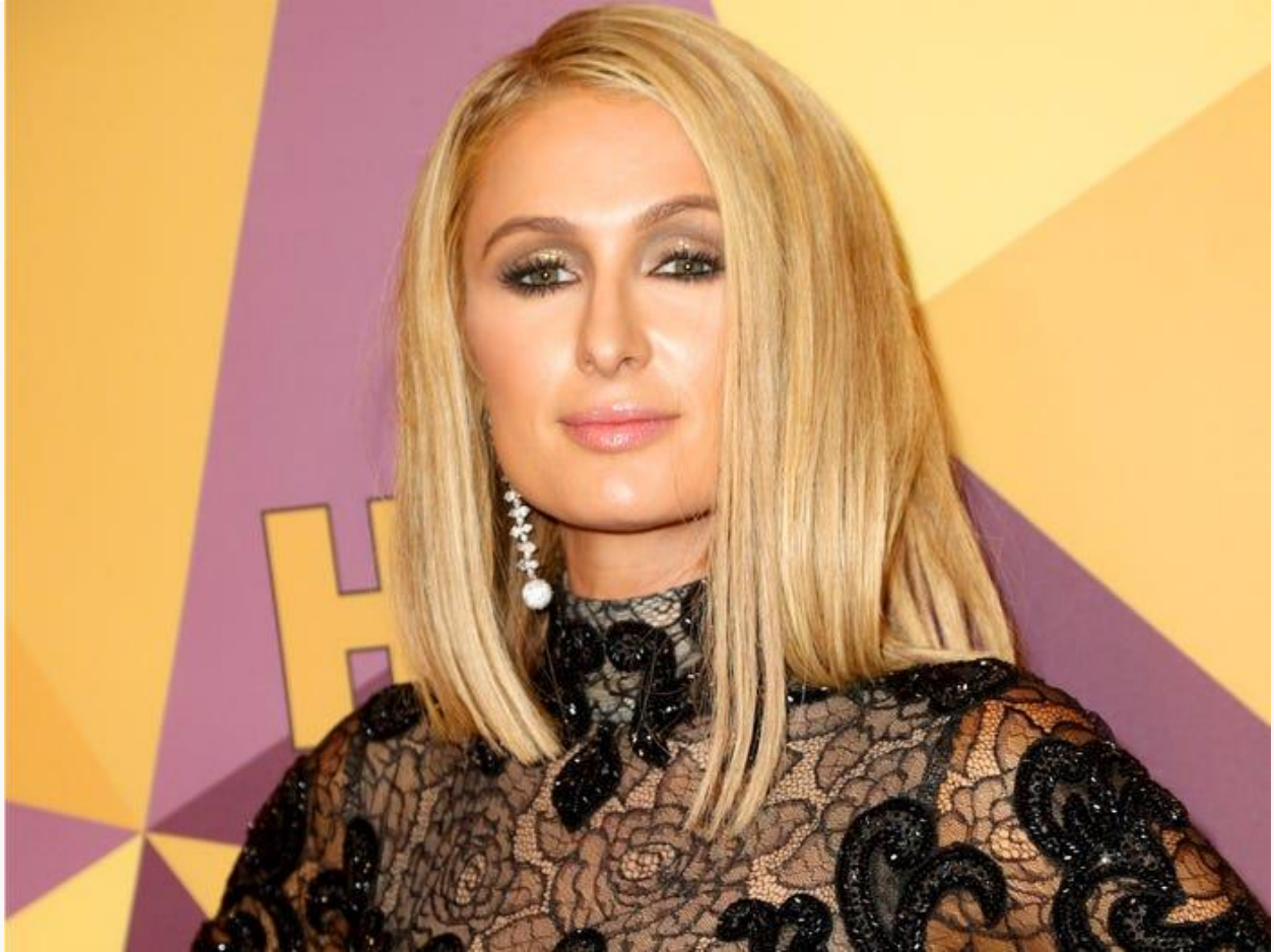
Paris Hilton.

Paris Hilton said she is a 20th cousin of the Queen through King Henry II. She's also related to Marilyn Monroe.