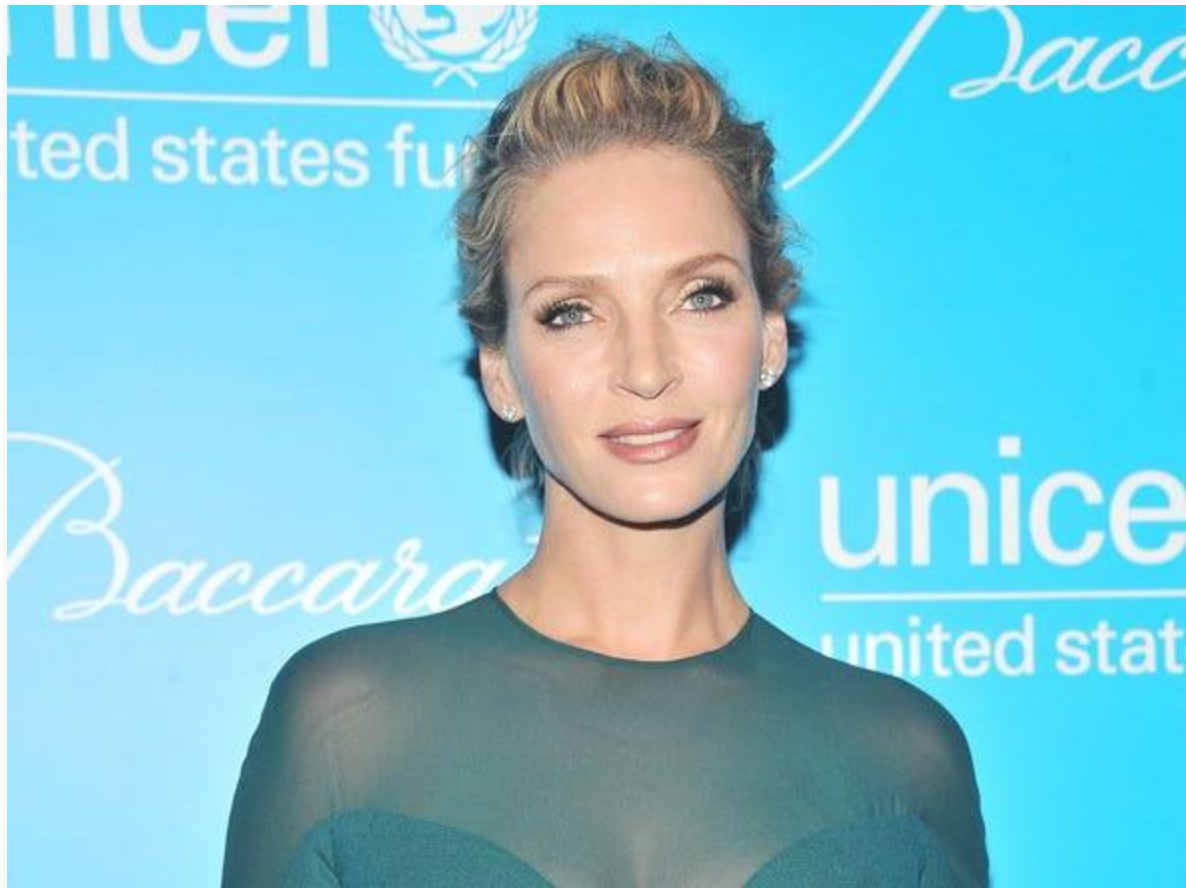
Uma Thurman.

Their shared ancestor is King Edward I, who ruled from 1272 to 1307.