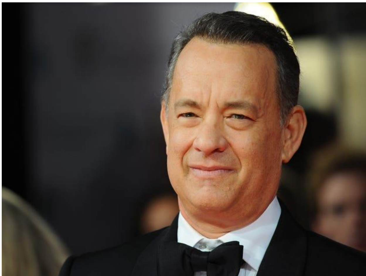
Tom Hanks.

They share the common ancestor of King John, whose reign was even earlier: 1199-1216.