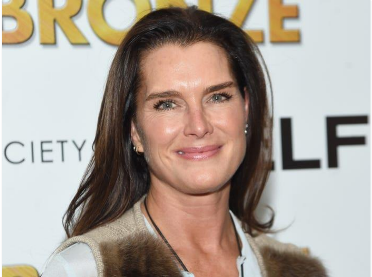
Brooke Shields.

Shields traces her Royal lineage through French royalty before English, according to the FindMyPast.com study. She is a descendant of King Henry IV of France, who was assassinated in 1610. The common ancestor she shares with the Queen is John of Gaunt, 1st Duke of Lancaster and son of England's Edward III.