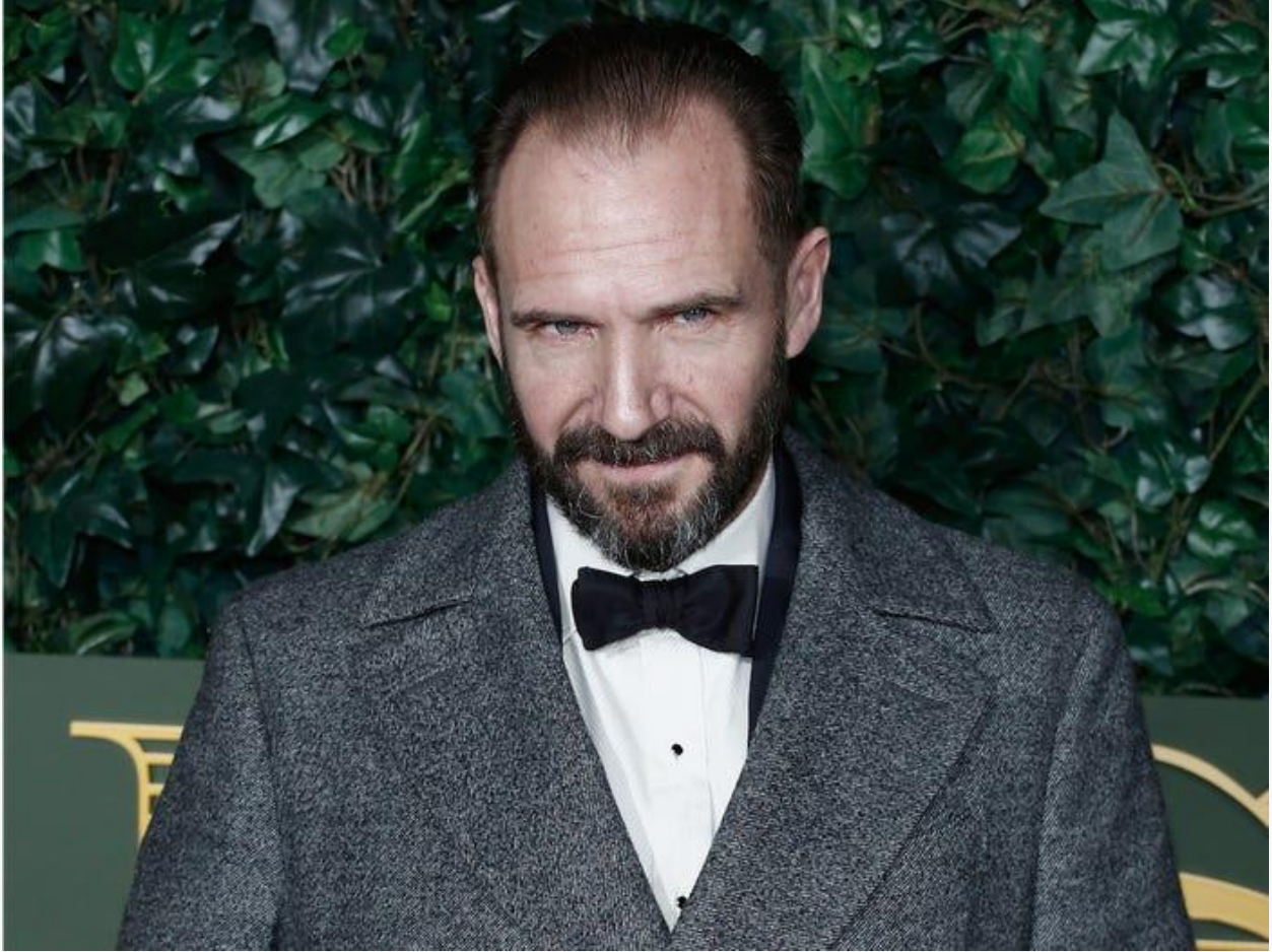
Ralph Fiennes.

According to the Financial Times , they are eighth cousins. They are related through James II of Scotland, who ruled during the 1400s.