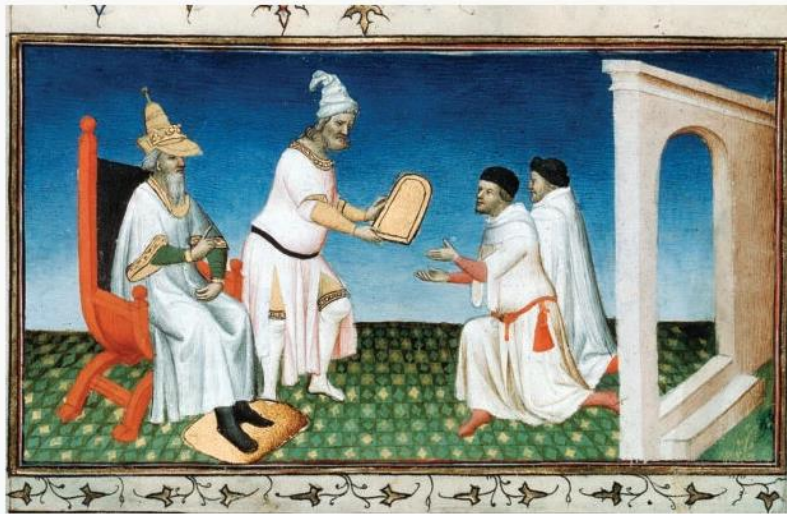
Kublai Khan, ruler of the Mongol empire, 1260-94, presents the Polos with their passport. This tablet, a 'paiza', guaranteed their safety whilst in his employ