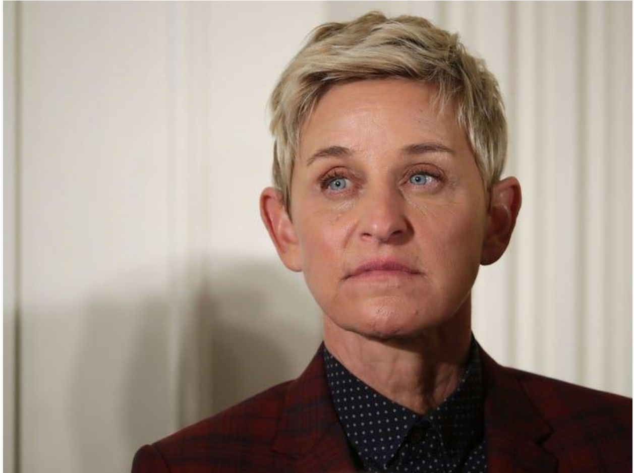
Ellen DeGeneres

According to the New England Genealogical Society, DeGeneres is also 15th cousins with the Duchess of Cambridge Kate Middleton through Sir Thomas Fairfax and his wife, Agnes Gascoigne, who were both born in the 1400s.