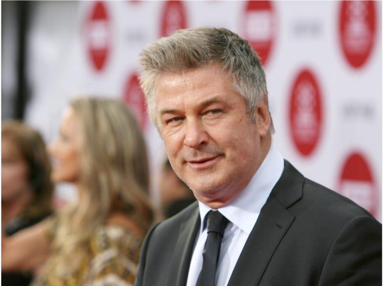
Alec Baldwin.

Baldwin and the Queen's shared ancestor is Ethelred the Unready, who was born in the year 986.