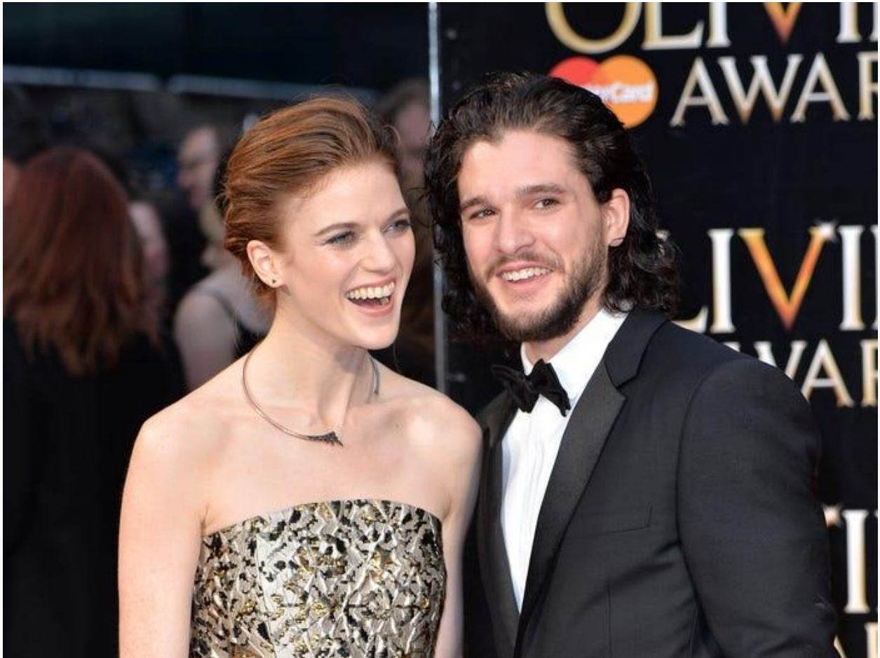
Rose Leslie and Kit Harington.

Kit Harington and his wife, Rose Leslie, have royal blood in real life — they're actually distantly related to each other.