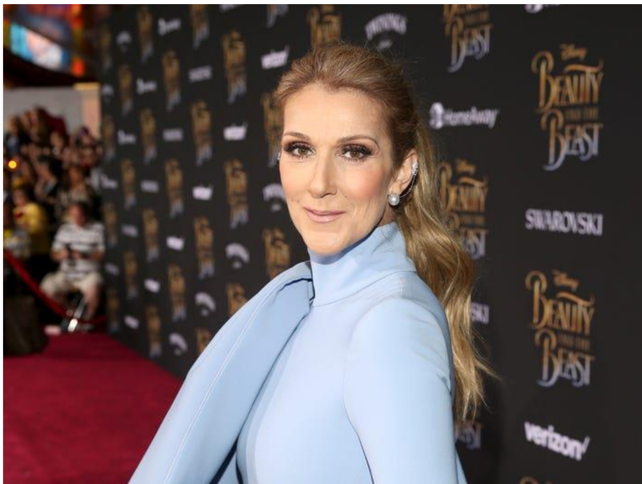
Celine Dion.

The singer is also distantly related to Madonna, according to the records . They're 10th cousins, once and twice removed, sharing two different ancestors.