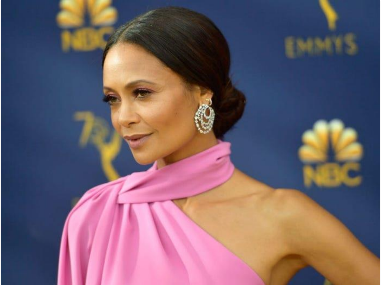
Thandiwe Newton.

Newton is the daughter of a Zimbabwean princess, which makes her a princess as well according to Shona custom.