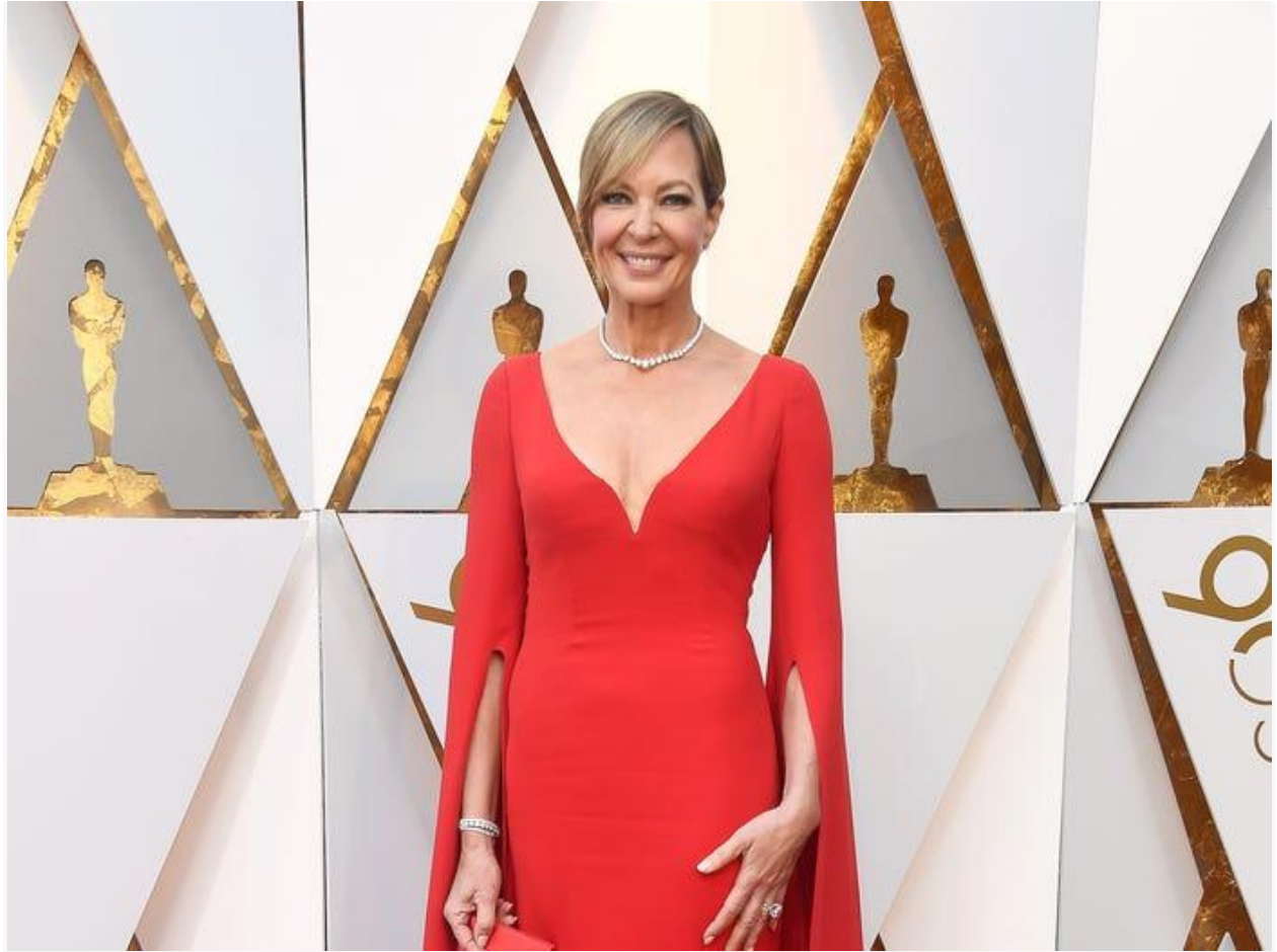
Allison Janney.

The Academy Award-winning actress and the Queen are related through Edward I, who was England's king between 1272 and 1307, according to the FindMyPast.com study.