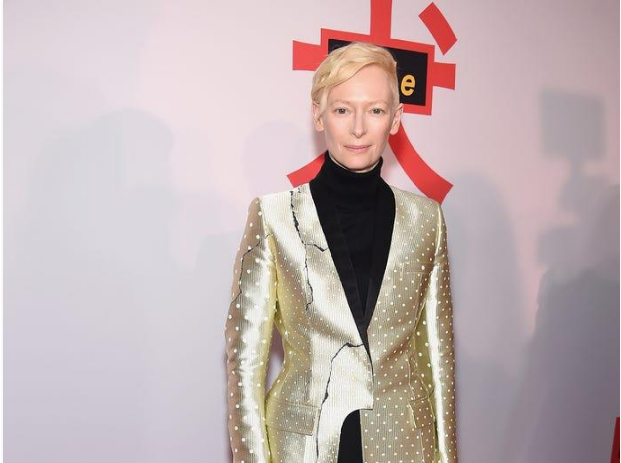
Tilda Swinton.

Swinton traces her lineage to Scottish king Robert the Bruce, Edinburgh researchers discovered in 2009 . Robert battled Edward I for control of Scotland as popularized in the film "Braveheart."