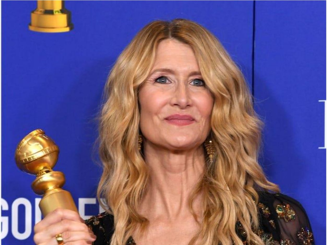
Laura Dern.