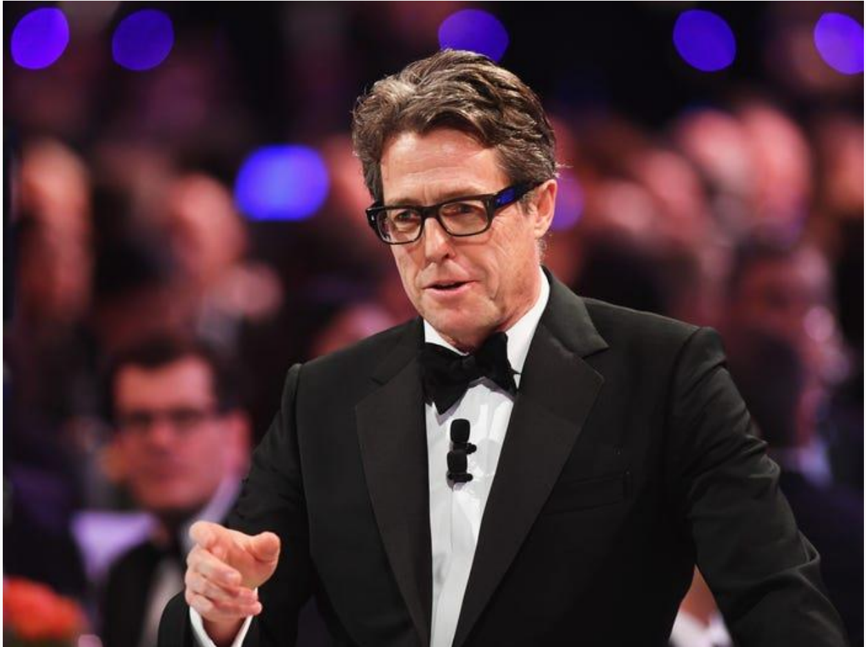
Hugh Grant.

Grant could trace his lineage back to King Henry VII of England and King James IV of Scotland, according to the Radio Times . Grant is also distantly related to George Washington, Thomas Jefferson, and Alexander Hamilton.