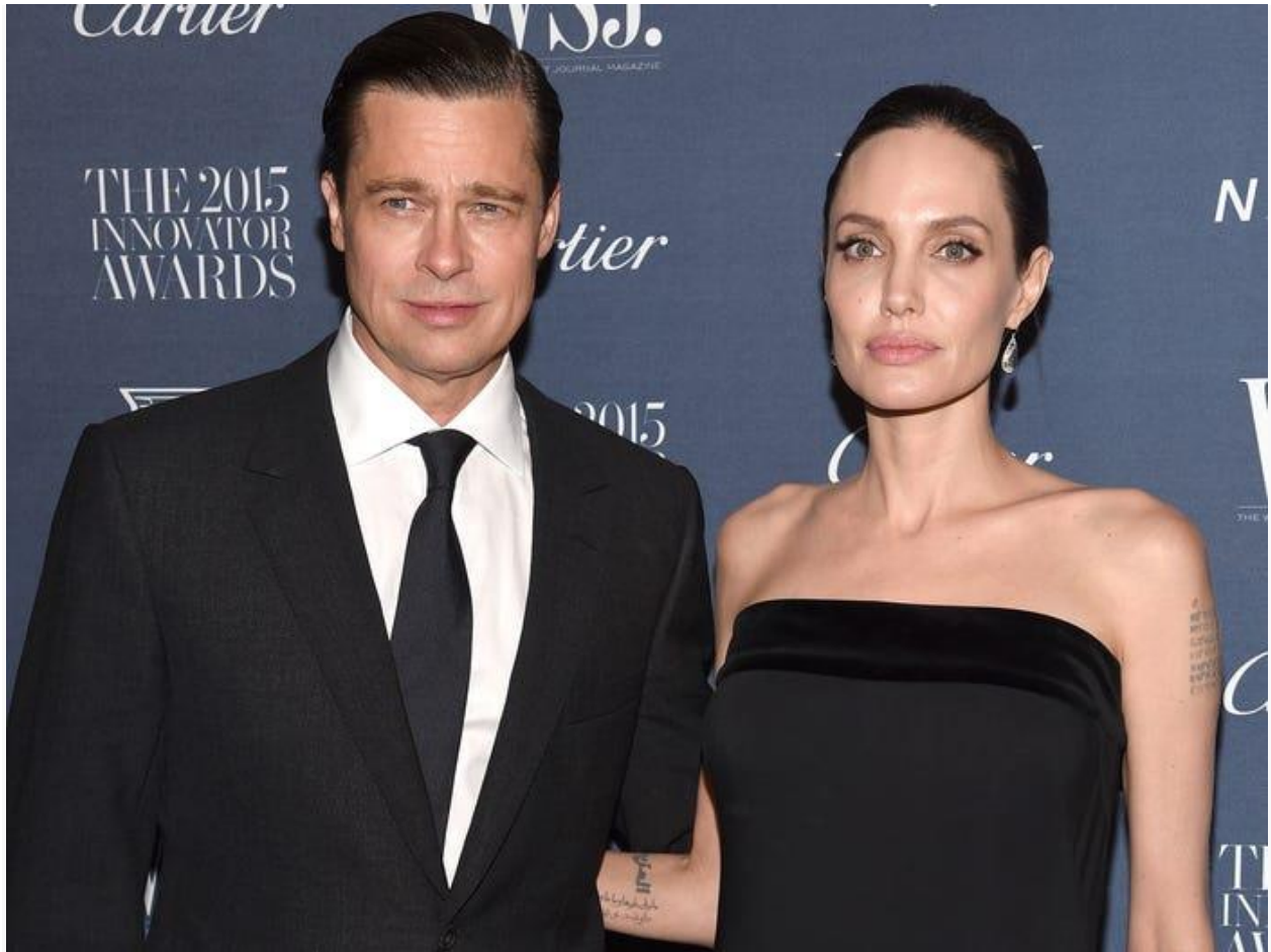
Brad Pitt and Angelina Jolie.

Pitt is slightly more royal (a 25th cousin, twice removed, of Queen), according to FindMyPast.com. His common ancestor is Henry II , who ruled in the 12th century. Jolie's connection to the royal family is through King Philip II of France, making her a 26th cousin of the Queen.