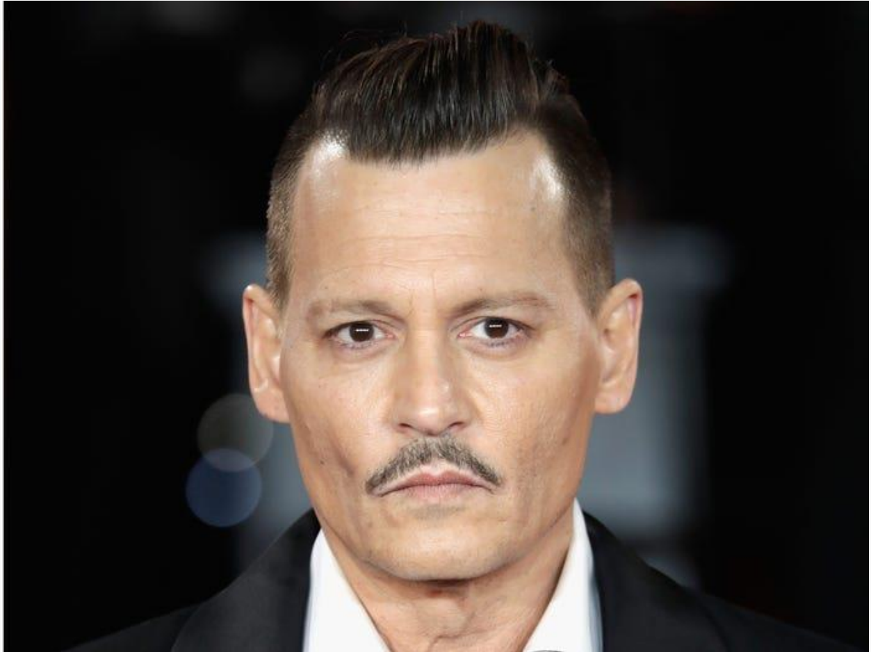
Johnny Depp.