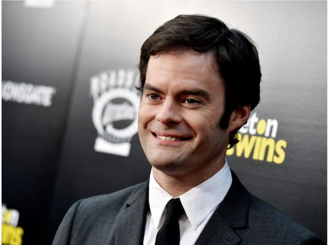
Bill Hader.

"I mean, the conqueror of Europe? I couldn't even get the coffeemaker to work this morning," Hader said on a 2016 episode of the show " Finding Your Roots ."