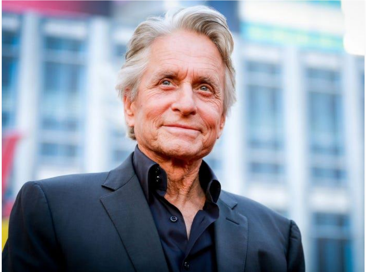
Michael Douglas.

Douglas' common ancestor is also King Edward III .