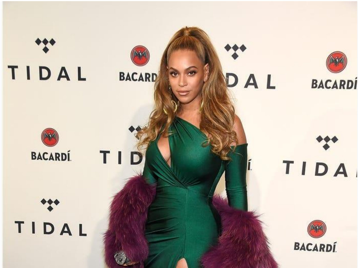
Beyoncé.

Beyoncé traces her royal roots through Louisiana, Acadia, and back to the French. According to FindMyPast.com , the common ancestor she shares is King Henry II, who was Queen Elizabeth's 24th great-grandfather.