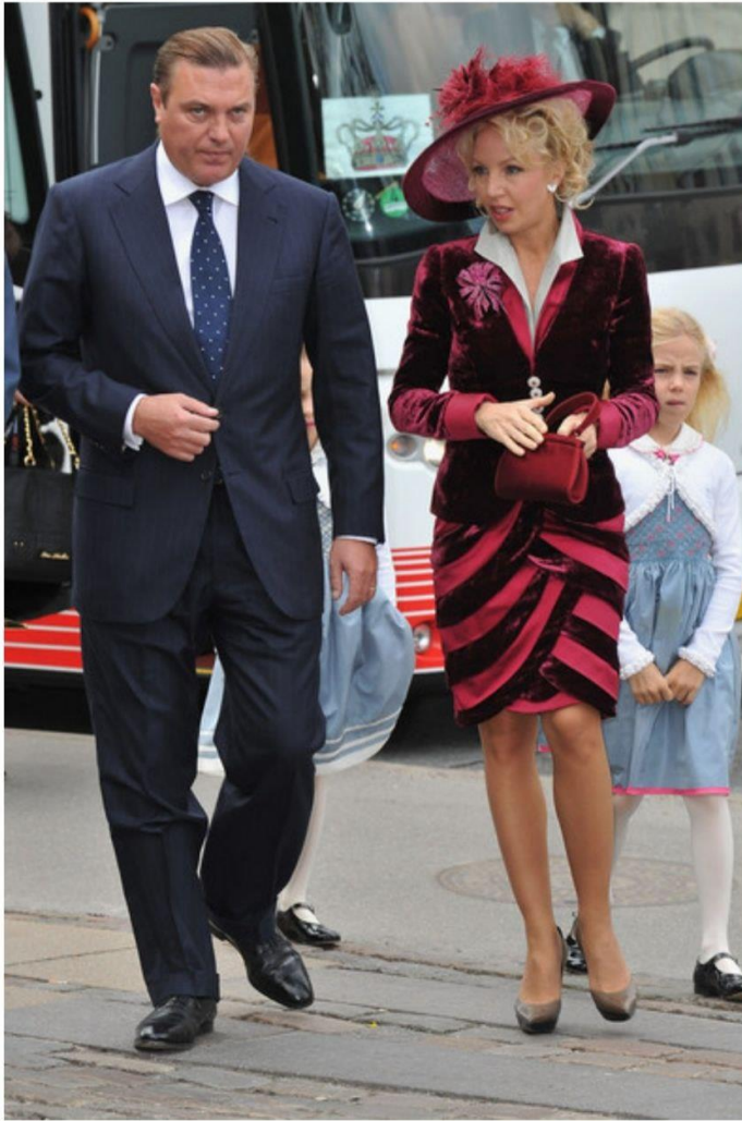
Prince Carlo of Bourbon-Sicilian Duke of Castro with his wife Princess Camilla. Prince Carlo of Bourbon-Two Sicilies is the owner of the New England crime family, the Montreal crime family, the Cuban mafia and the Trafficante crime family. Prince Carlo's sister Princess Beatrice is the mother of Prince Jean Christophe Napoleon Bonaparte