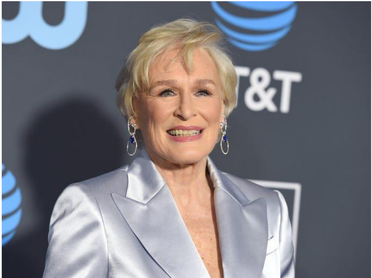
Glenn Close.

Like Tom Hanks, the seven-time Oscar nominee is related to the Queen through King John, according to FindMyPast.com .