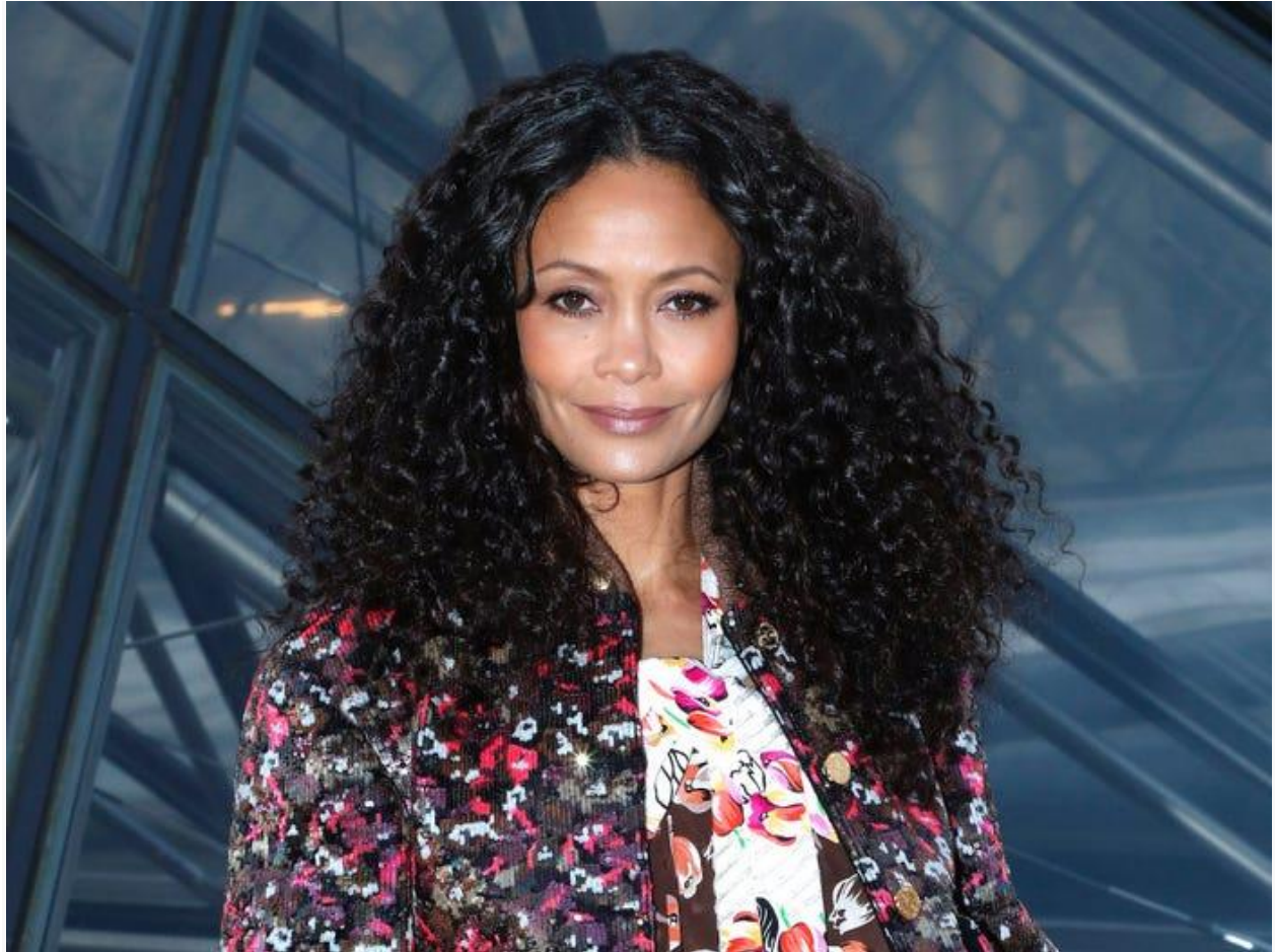
Thandiwe Newton.