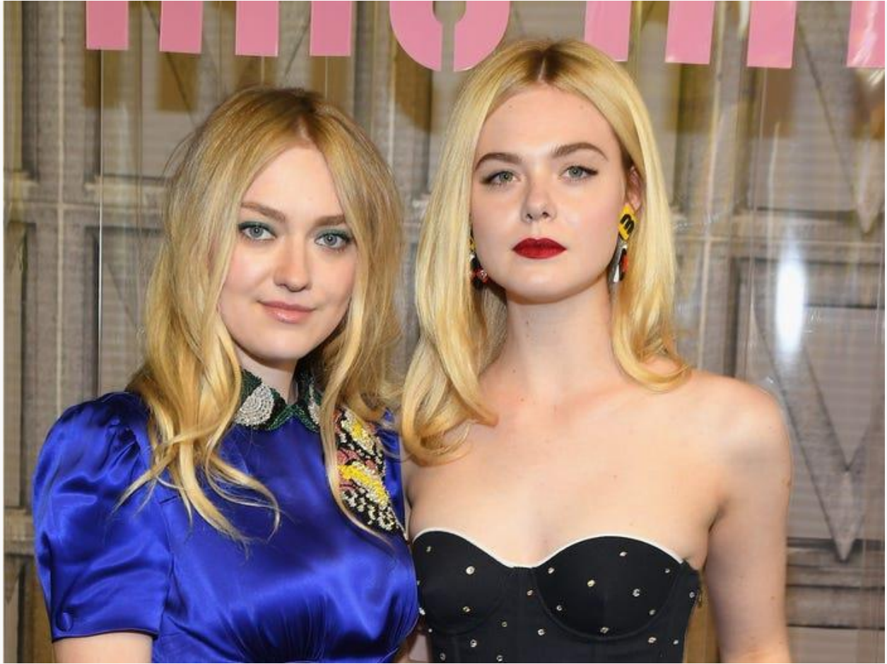
Elle and Dakota Fanning.

Edward III reigned during the start of the Hundred Years' War. The sisters are also 21st cousins of the Duchess of Cambridge , according to Ancestry.com.