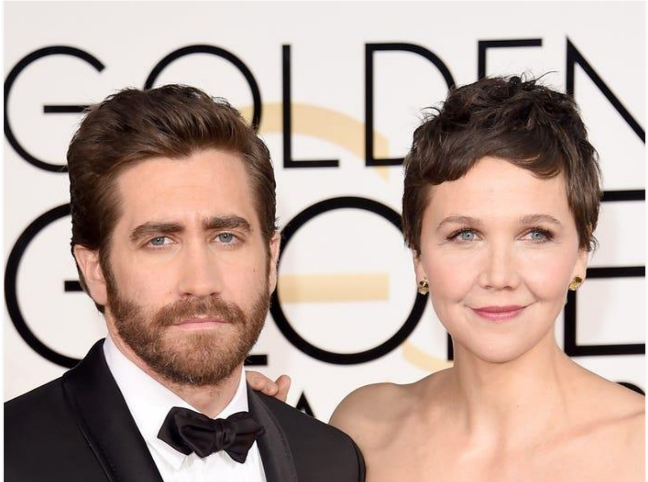
Jake and Maggie Gyllenhaal.

They traced their lineage back to King Edward III, who ruled from 1327 until 1377, according to CBS News .